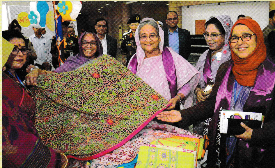
Honorable Prime Minister is visiting a stall of International Women's Day 2019 Program