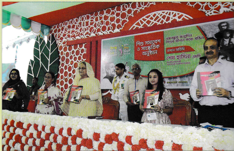
On the occasion of celebration of 99th birthday of the Father of the Nation Bongabandhu Sheikh Mujibur Rahman and National Children Day.